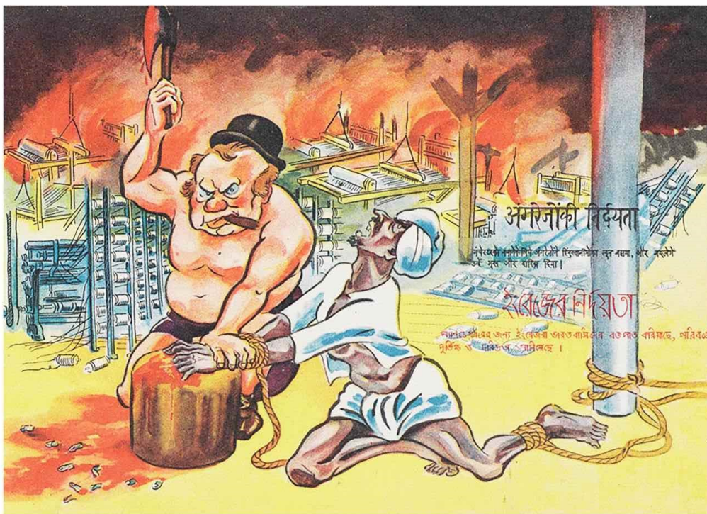
A Japanese propaganda leaflet from 1944 captured an illustration of Winston Churchill, depicting him as severing the fingers of an Indian cotton industry worker. The accompanying text delivers a message, accusing the British rulers of sacrificing the livelihood of Indians, resulting in widespread hunger and poverty, all in the name of safeguarding Manchester.

As a Lieutenant in the 4 th Hussars, Churchill developed friendships with Indian princes, the game's Indian patrons, profiting from his aristocratic lineage. His father, Lord Randolph, second son of the Duke of Marlborough had made a well-