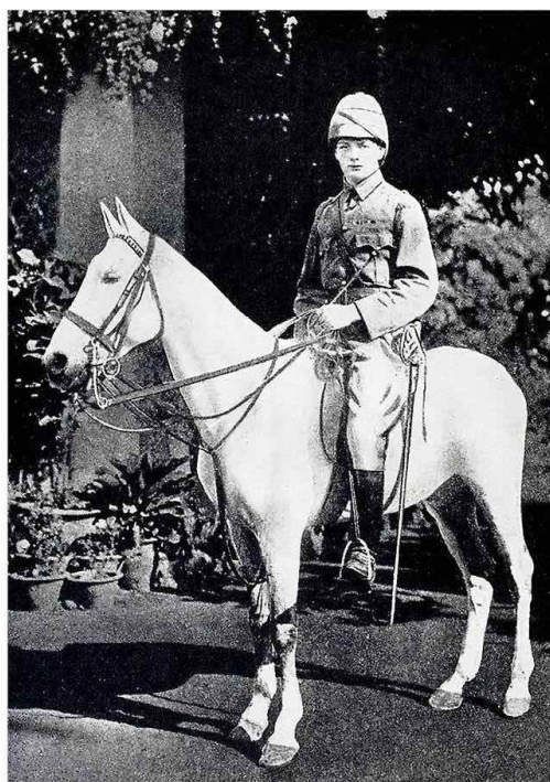
Winston Churchill on horseback in Bangalore, India in 1897

President Franklin Roosevelt sent a blunt message to Churchill on 11 April 1942, just as Stafford Cripps was leaving India at the termination of his intractable 'Mission'. FDR wrote: 'The feeling is almost universally held that the deadlock had been caused by the unwillingness of the British Government to concede to the Indians the right of self-government, notwithstanding the willingness of the Indians to entrust technical, military and naval defense control to the competent British authorities. American public opinion cannot understand why, if the British Government is willing to permit component parts of India to secede