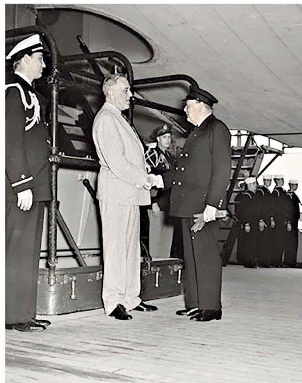
Franklin Roosevelt and Winston Churchill, August 9, 1941.

When key documents are missing, we are left with scraps of information, which read together make up a partial mosaic that points to hidden truths. My book also offers these and some other bits of evidence that bear reflection. I hope that my holistic survey of Churchill's India connections, the first